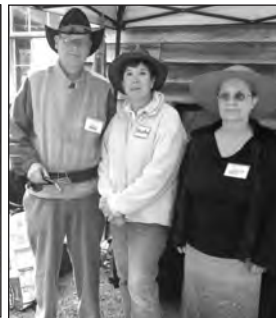
Re-enactors from House in the Horseshoe and Friends of the Bryant House