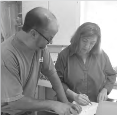
Strangers when arrived to do genealogy research at Shaw House discover they are cousins.