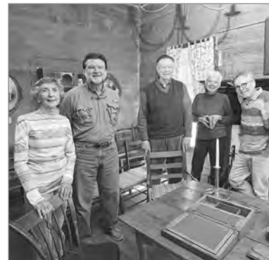
Past and Present Board Members discuss MCHA history.

Hotel in Pinehurst. It is a silent auction, donations for the Sandhills Children's Center. If you want to help, let us know.