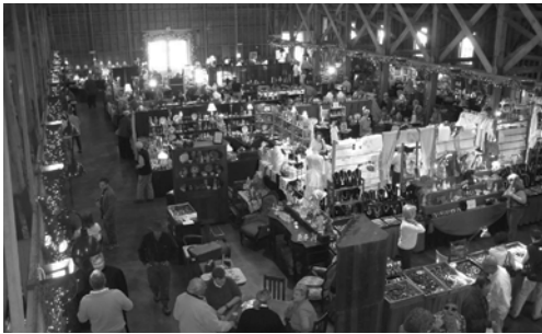
The 2008 Antiques Show and Sale at the Fair Barn.