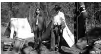
ABOVE: Clenny Creek Day: Musicians on the porch of Bryant House and period reenactments on the grounds provided a day loaded with fun for all attending.