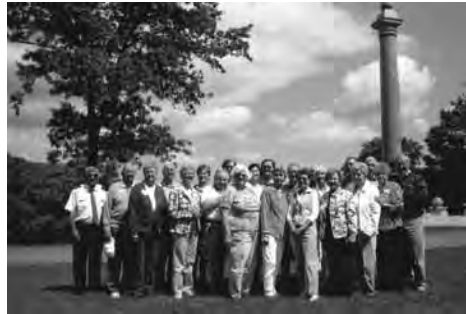
LEFT: Twenty-two members and friends traveled to the Hudson River Valley area for a week long tour this past spring.