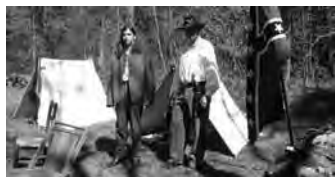
ABOVE: Clenny Creek Day: Musicians on the porch of Bryant House and period reenactments on the grounds provided a day loaded with fun for all attending.