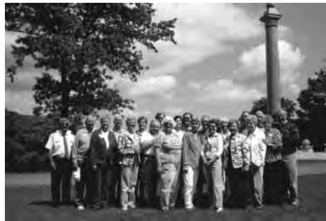
LEFT: Twenty-two members and friends traveled to the Hudson River Valley area for a week long tour this past spring.