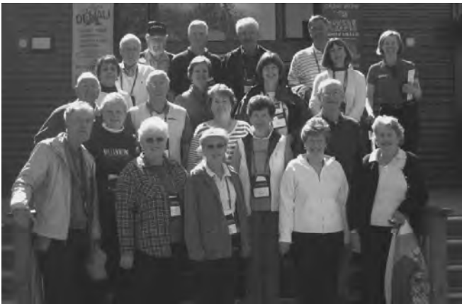
Above: Twenty-one hardy souls from MCHA spent 12 wonderful days touring Alaska by coach and ship, beginning in Fairbanks and ending in Vancouver. Some of the highlights of the trip were dinner at a local Alaskan family home, a visit to Denali National Park, a train trip through the Alaskan wilderness, whale watching, tours on floatplanes and helicopters, visits to Haines, Juneau, Ketchikan, and a relaxing cruise on the Statendam. Great weather and wonderful new friends.