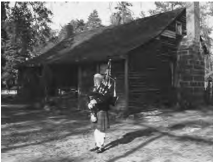
CHRISTMAS OPEN HOUSE Left: Bagpiper welcomes guest to the 2006 Christmas Open House at the Shaw House, Garner House and Sanders Cabin in Southern Pines.